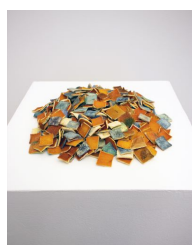
Keren Benbenisty 365 Days in Jaffa, 2021 365 Jaffa orange peels and ink Dimension variable, exhibited on a pedestal 14 x 14 x 36 inches BENke-015