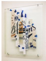
Keren Benbenisty Blurang, 2021 Paper collage and blue tape on glass 12 x 10 in (30.5 x 25.4 cm) BENke-012