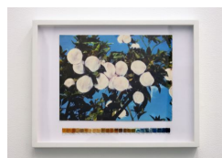
Keren Benbenisty Untitled, 2021 A page from a vintage book, orange peels, and ink x in (0 x 0 cm) 11 3/4 x 15 1/4 x 1 1/2 in (29.8 x 38.7 x 3.8 cm) Framed BENke-016