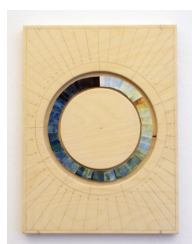
Keren Benbenisty Bluranjmeter, 2020 Wood, paper, and ink 15 3/4 x 11 3/4 x 0 5/8 in (40 x 29.8 x 1.6 cm) BENke-014