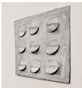
William Eric Brown Blind 2019 28 x 22 ¼ x 1 7/8 inches Painted bronze BROwi-002