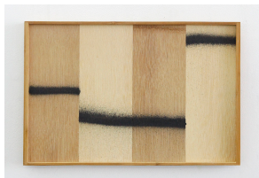
Michelle Brandemuehl Untitled 2018 11 x 17 inches Spray paint on found object BRAmi-002