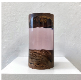
Sarah Tortora Witness Mark XXIV 2018 3 ½ x 2 x 2 inches Urethane resin, wood burl TORsa-002