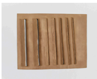
William Eric Brown Blind 2019 22 ¼ x 28 x 2 inches Bronze BROwi-001