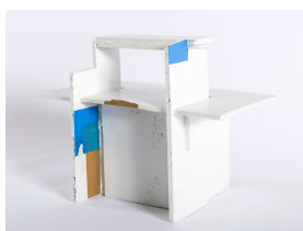
William Eric Brown Shelter 8 2017 7 ½ x 9 ½ x 5 ½ inches Painted bronze BROwe-003