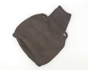
Flat Half Pot 2013 9 x 7 ¼ x ¾ inches Stoneware, oxide NARke-003