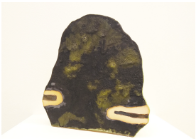
Keiko Narahashi Green Hair 2015 10 x 10 x 5 inches inches Glazed stoneware NARke-001