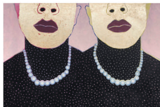
Johnny Floyd, Upon Reflection, I am Aphrodite's Pearls Strung Across the Firmament, 2021. Oil, acrylic & gold leaf on canvas.