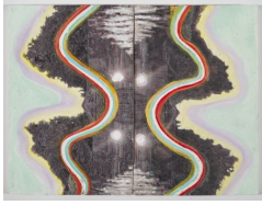
Selena Kimball The Serpent , 2021 Silkscreen on linen, oil, plaster and wood on panel 14 x 18 in (35.6 x 45.7 cm) KIMse-003