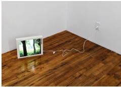
Midori Harima This is a Mirror, after Camnitzer [ver. Recurrent] , Lightbox, 2022 Archival inkjet print on Yupo paper, Fujicolor lightbox 11 1 / 4 x 14 1 / 4 x 2 1 / 8 in (28.6 x 36.2 x 5.4 cm) HARmi-003