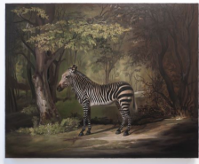
Jen Mazza Terpsichore (1760) , 2022 Oil on canvas 40 x 60 in (101.6 x 152.4 cm) MAZje-001