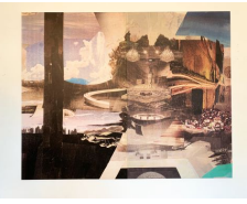
Selena Kimball Untitled Times (Chandeliers) , 2020 Silkscreen on linen and acrylic on panel 63 x 79 1/2 in (160 x 201.9 cm) KIMse-001