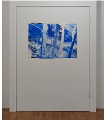
Midori Harima This is a Mirror, After Camnitzer [ver. Recurrent] , Print on the Wall, 2022 Silkscreen on wall 26 x 36 in (66 x 91.4 cm) HARmi-002